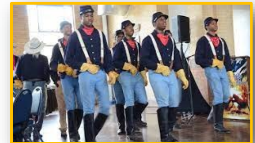
"We Can, We Will" - "Ready & Forward"

We have a strong youth focus. We strongly believe the youth must have a rooted and grounded understanding of their historical legacy. This enables them to build and grow great futures as well as it allows us to continue to share our valuable history for generations to come. Our Buffalo Soldier Corps featuring the Jr. Buffalo Soldiers program is the foundation of our youth engagement. Through our educational programs our youth are immersed in the lifestyles, ways and history of the Buffalo Soldiers. Our motto "Learn while having fun!"